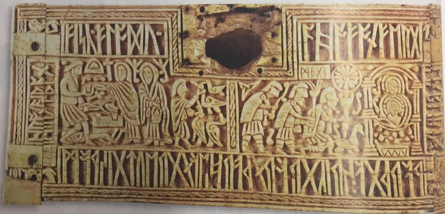
(Left) the Germanic hero Weland at his forge and (right) the adoration of the Magi (8th century), from the Franks casket. Whalebone. British Museum.

? 257–274. What is Beowulf's final revenge against Grendel? What action of Beowulf's provides a resolution , or wrapping up, of the episode?