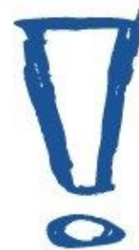
Grammar and Vocabulary