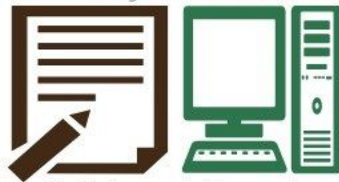
Writing and Research