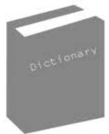
Grammar and Vocabulary