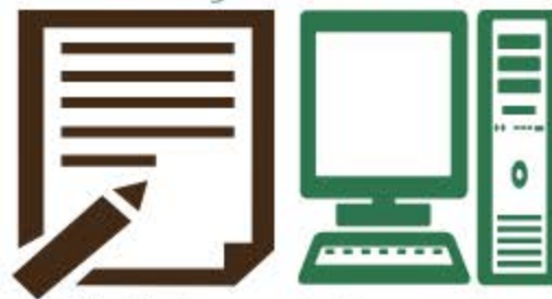
Writing and Research