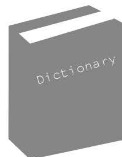
Grammar and Vocabulary