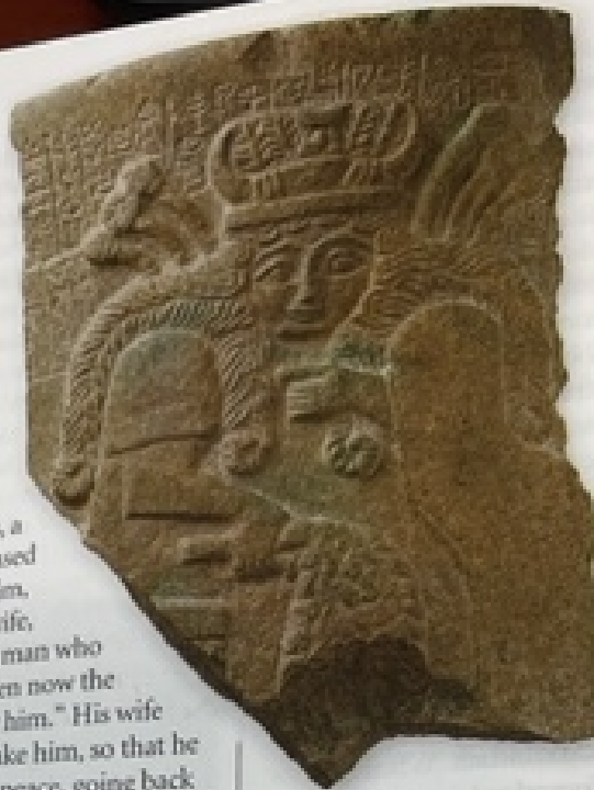
Stone vessel fragment with depiction of a goddess (c. 2400 B.C.), Sumerian.

So she baked loaves of bread, each day one loaf, and put it beside his head, and she marked on the wall the days that he slept; and there came a day when the first loaf was hard, the second loaf was like leather, the third was soggy, the crust of the fourth had mold, the fifth was mildewed, the sixth was fresh, and the seventh was still on the embers. Then Utnapishtim touched him and he woke. Gilgamesh said to Utnapishtim the Faraway, "I hardly slept when you touched and roused me." But Utnapishtim said, "Count these loaves and learn how many days you slept, for your first is hard, your second like leather, your third is soggy, the crust of your fourth has mold, your fifth is mildewed, your sixth is fresh and your seventh was still over the glowing embers when I touched and woke you." Gilgamesh said, "What shall I do, O Utnapishtim, where shall I go? Already the thief in the night has hold of my limbs, death inhabits my room; wherever my foot rests, there I find death."