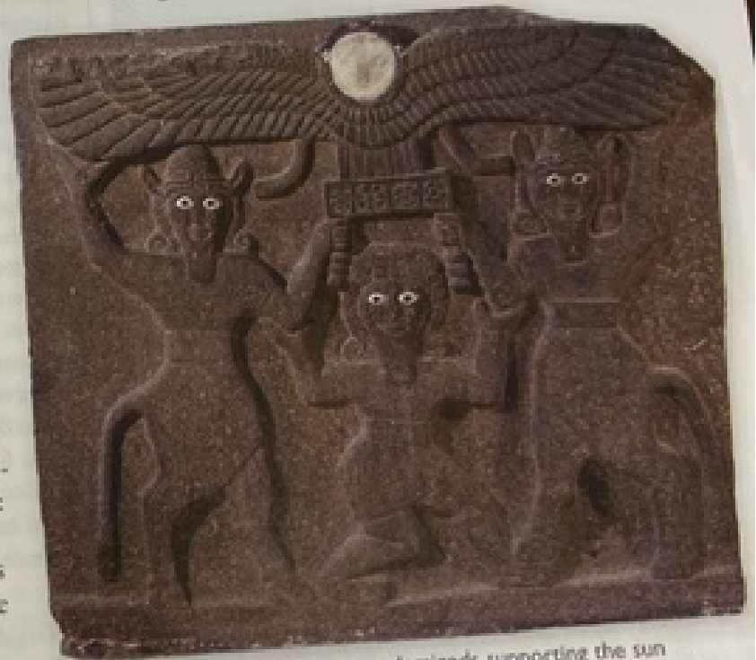
Gilgamesh between two demigods supporting the sun (9th century B.C.E.). Syro-Hittite stele from Tell Halaf, Syria. Archaeological Museum, Aleppo, Syria.

"In the first light of dawn all my household gathered round me, the children brought pitch and the men whatever was necessary. On the fifth day I laid the keel and the ribs, then I made fast the planking. The ground-space was one acre, each side of the deck measured one hundred and twenty cubits, making a square. I built six decks below, seven in all, I divided them into nine sections with bulkheads between. I drove in wedges where needed, I saw to the punt-poles, and laid in supplies. The carriers brought oil in baskets, I poured pitch into the