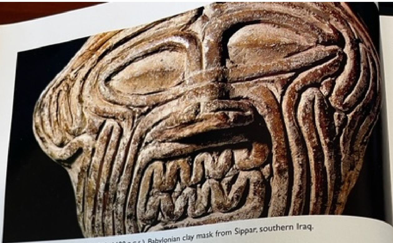
The demon Humbaba (c. 1800–1600 B.C.E.). Babylonian clay mask from Sippar, southern Iraq. The British Museum, London.