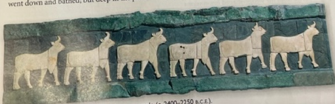
Frieze with inlays of cows from a Ninursanga temple (c. 2400–2250 B.C.E.), Sumerian, from Tell al Ubaid, Iraq.

This too was the work of Gilgamesh, the king, who knew the countries of the world. He was wise, he saw mysteries and knew secret things, he brought us a tale of the days before the flood. He went a long journey, was weary, worn out with labor, and returning engraved on a stone the whole story.