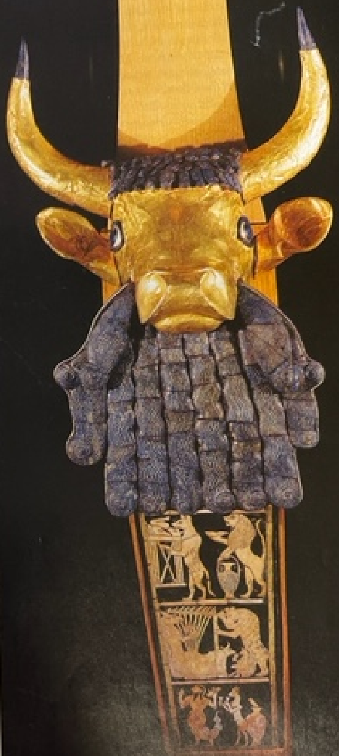
Great lyre with bull's head and inlaid front panel (c. 2680 B.C.E.). Sumerian, from Ur. University of Pennsylvania Museum, Philadelphia (B17694).

Gilgamesh answered her, "And why should not my cheeks be starved and my face drawn? Despair is in my heart and my face is the face of one who has made a long journey, it was burned with heat and with cold. Why should I not wander over the pastures in search of the wind? My friend, my younger brother, he who hunted the wild ass of the wilderness and the panther of the plains, my friend, my younger brother who seized and killed the Bull of Heaven and overthrew Humbaba in the cedar forest, my friend who was very dear to me and who endured dangers beside me, Enkidu my brother, whom